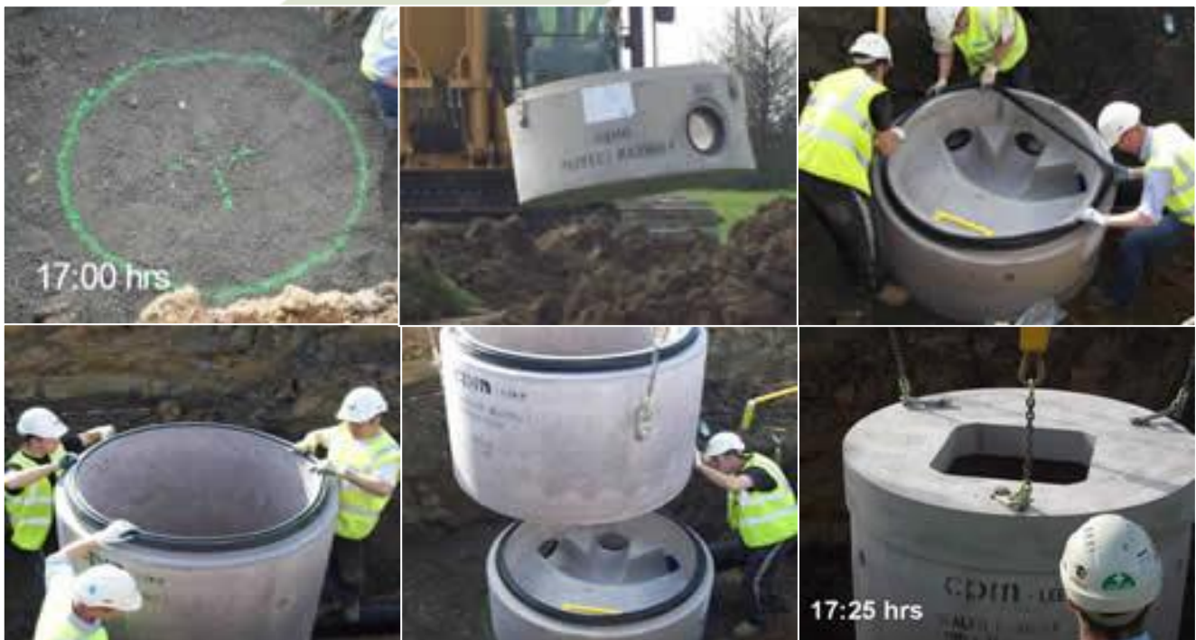
Formation to cover slab in 25 minutes

UK Water Companies have embraced the new circular precast manhole base systems and given their acceptance to use the design on new projects in lieu of traditional in-situ construction. Incorporation as a typical detail is expected within the latest publication of Sewers for Adoption.