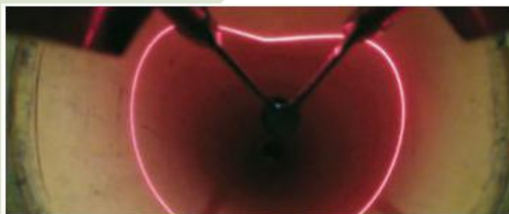
Inverse curvature outlined by laser profiler