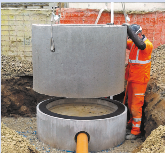
Typical precast manhole base.

An example of this is the precast concrete manhole system, where high performance seals and extra-thick chamber walls ensure long term watertightness and durability.