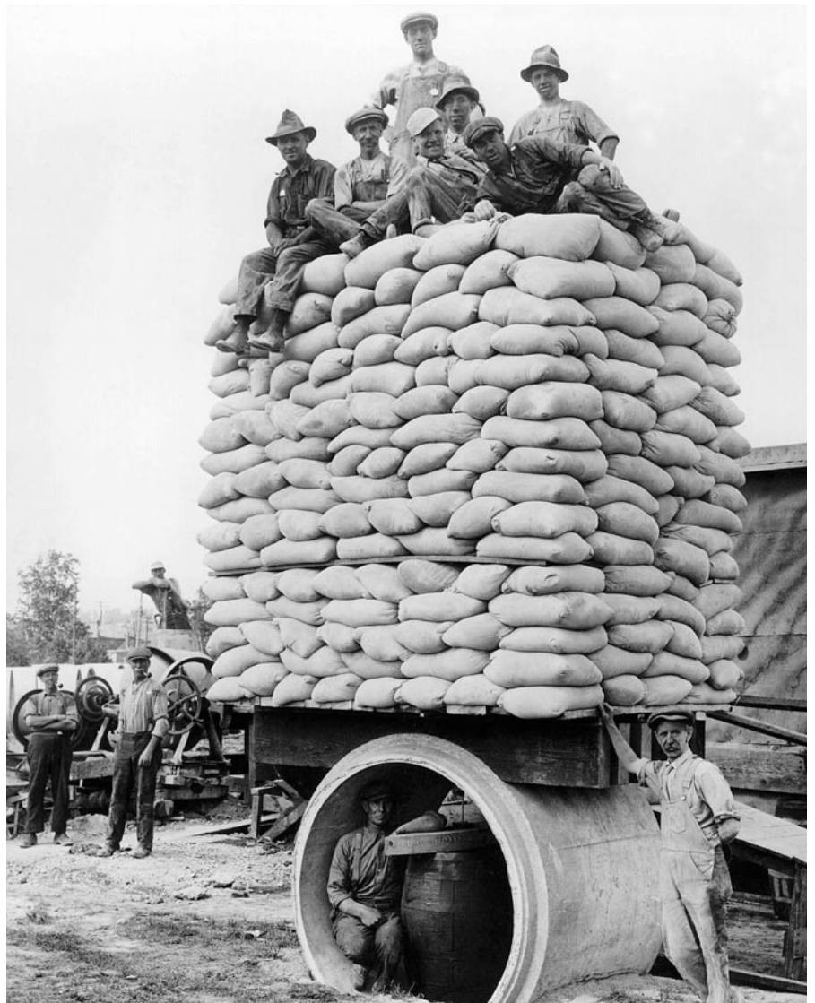
Workers loading large diameter concrete pipe with sand bags for load bearing test. The photo strongly suggests that pipe producers were aware of the need for long-lasting durable pipelines and culverts constructed with their pipe. Legacy pipelines and culverts attest to the quality of the pipe.

When considering the term durability in the context of concrete pipelines, "service life" is a notion that is understood by specifiers, owners and contractors. Durability of a pipeline is the capability of the system to